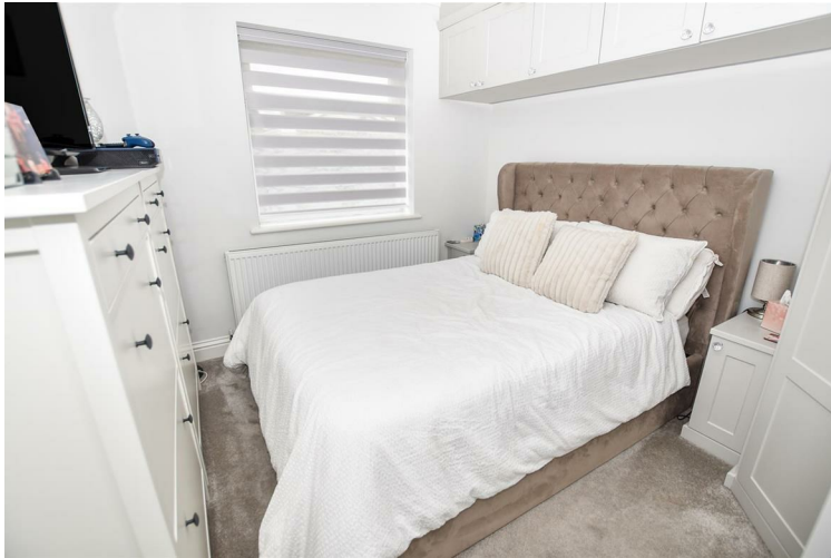
Bedroom 10'8 x 8'11 (3.25m x 2.72m)

Upvc double glazed window to rear aspect, coved smooth plastered ceiling, carpet, range of fitted wardrobes and bedroom furniture, radiator, TV and power points.