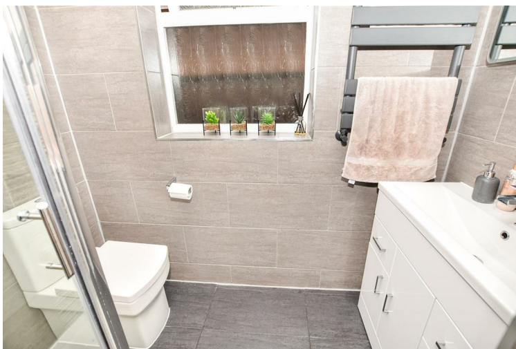
Shower Room 6'10 x 5'10 (2.08m x 1.78m)

Upvc double glazed obscure window to side aspect, smooth plastered ceiling with inset spotlights, tiled flooring, fully tiled walls, shower cubicle with glass sliding doors, ceiling fitted rainfall chrome shower head and hand held, vanity unit with inset hand wash basin and chrome waterfall tap, close coupled W.C, wall mounted heated towel rail.